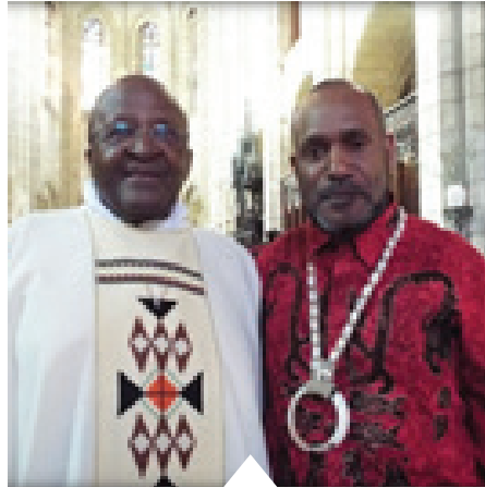
DESMUND TUTU AND BENNY WENDA