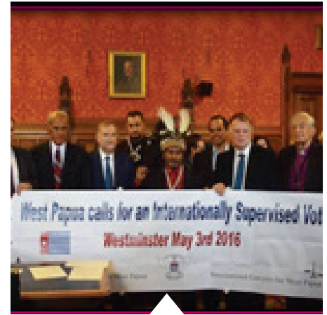
THE LAUNCHING OF THE WESTMINSTER DECLARATION, MAY 3, 2016