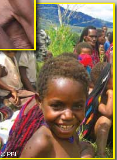
People in the Papua highlands.